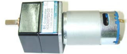
(A).Standard DC Motor Specifications :